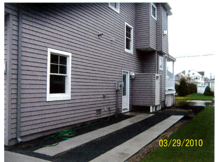
Left Side View – Date of Photograph: (See Photo Stamp)